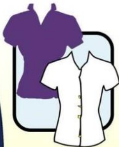
BLOUSE WITH SLEEVES