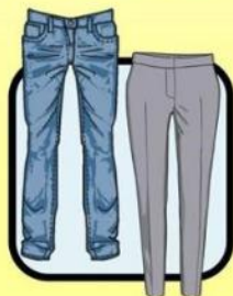
JEANS OR SLACKS