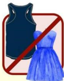
TUBES AND RACERBACKS