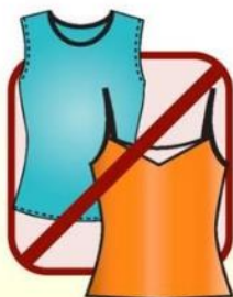
SLEEVELESS AND PLUNGING NECKLINES