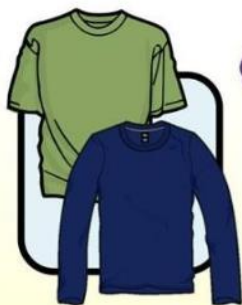
T-SHIRT OR LONG SLEEVES