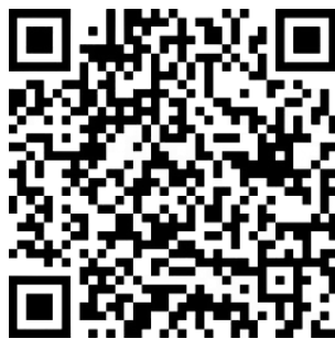
Catholic Welfare Services

DONATIONS FOR THE UNDERPRIVILEGED - Please continue to support the Catholic Welfare Services financially as we minister to the poor and needy in our midst irrespective of race or creed. Parishioners may donate to C.W.S. via S Pay Global by scanning this QR code. Verify that the recipient is ' Catholic Welfare Services ' before confirming the transaction. Parishioners may also do online transfer or cash deposit to the following: