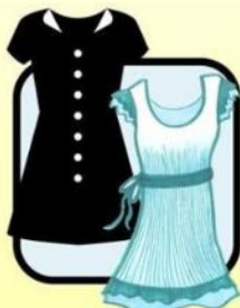
KNEE-LENGTH DRESS WITH SLEEVES