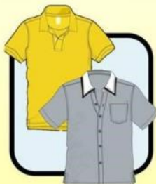
POLO SHIRT OR COLLARED SHIRT