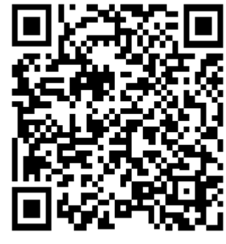
St. Joseph's Cathedral

You may also drop your weekly donations into the big wooden Collection Boxes placed at the Cathedral entrances OR do online transfer or cash deposit to St. Joseph's Cathedral Bank Account as follows: