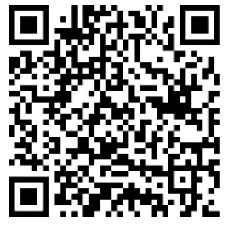
Catholic Welfare Services

<u>DONATIONS</u> FOR THE UNDERPRIVILEGED - Please continue to support the Catholic Welfare Services financially as we minister to the poor and needy in our midst irrespective of race or creed. Parishioners may donate to C.W.S. via S Pay Global by scanning this QR code. Verify that the recipient is 'Catholic Welfare Services' before confirming the transaction. Parishioners may also do online transfer or cash deposit to the following: