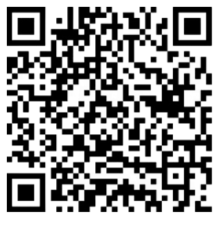
Catholic Welfare Services

<u>DONATIONS</u> FOR THE UNDERPRIVILEGED - Please continue to support the Catholic Welfare Services financially as we minister to the poor and needy in our midst irrespective of race or creed. Parishioners may donate to C.W.S. via S Pay Global by scanning this QR code. Verify that the recipient is 'Catholic Welfare Services' before confirming the transaction. Parishioners may also do online transfer or cash deposit to the following: