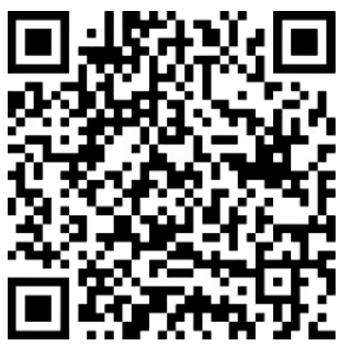
Catholic Welfare Services

<u>DONATIONS</u> FOR THE UNDERPRIVILEGED - Please continue to support the Catholic Welfare Services financially as we minister to the poor and needy in our midst irrespective of race or creed. Parishioners may donate to C.W.S. via S Pay Global by scanning this QR code. Verify that the recipient is 'Catholic Welfare Services' before confirming the transaction. Parishioners may also do online transfer or cash deposit to the following: