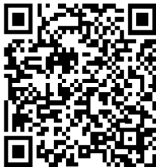
St. Joseph's Cathedral

You may also drop your weekly donations into the big wooden Collection Boxes placed at the Cathedral entrances OR do online transfer or cash deposit to St. Joseph's Cathedral Bank Account as follows: