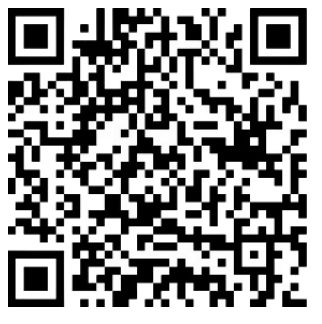
Catholic Welfare Services

<u>DONATIONS</u> FOR THE UNDERPRIVILEGED - Please continue to support the Catholic Welfare Services financially as we minister to the poor and needy in our midst irrespective of race or creed. Parishioners may donate to C.W.S. via S Pay Global by scanning this QR code. Verify that the recipient is 'Catholic Welfare Services' before confirming the transaction. Parishioners may also do online transfer or cash deposit to the following: